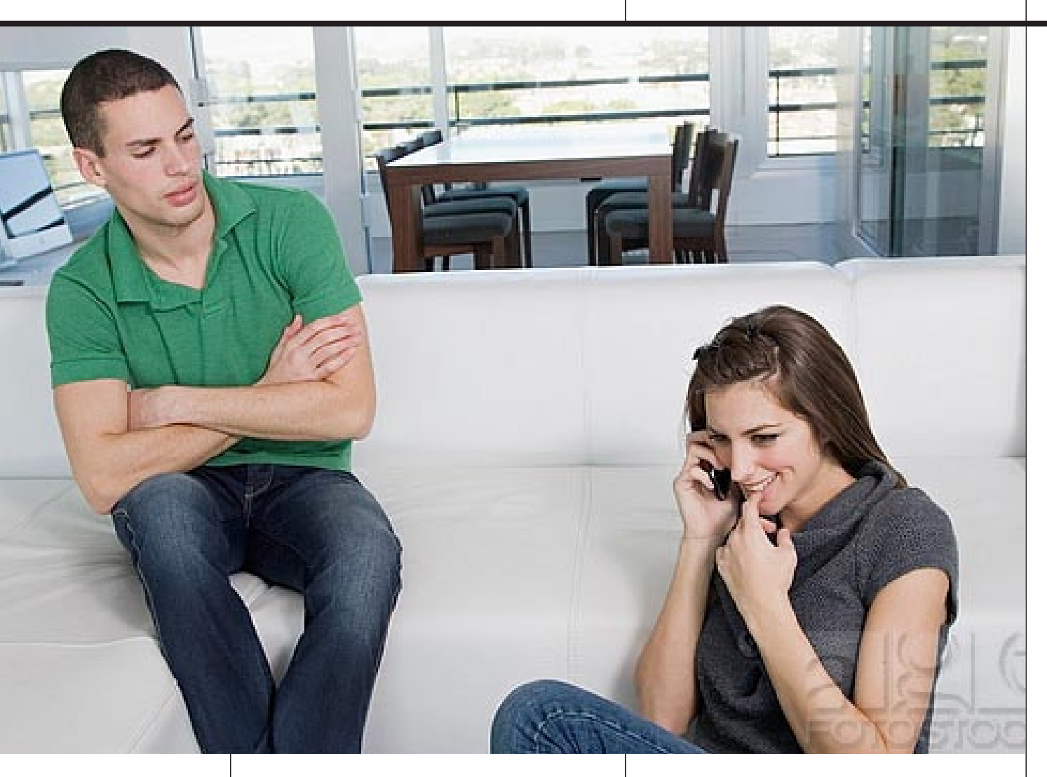
ANXIOUS attachment style craves closeness and needs consistent reassurance from a partner.

love them back. Avoidant people equate intimacy with a loss of independence and constantly try to minimize closeness.